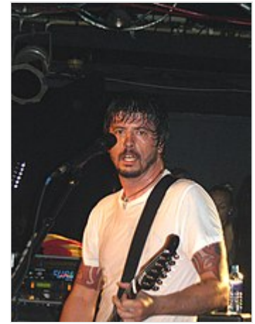
Grohl performing with the Foo Fighters in 2006

During September and October 2005, the band toured with Weezer on what was billed as the Foozer Tour. [35] The Foo Fighters played a headline performance at the 2005 Reading and Leeds Festivals. On June 17, 2006, the Foo Fighters performed their largest non-festival headlining concert to date at London's Hyde Park . Motörhead's Lemmy joined the band on stage to sing Shake Your Blood from Dave Grohl's Probot album. As a surprise performance, Brian May and Roger Taylor of Queen appeared to play part of We Will Rock You as a lead in to Tie Your Mother Down .