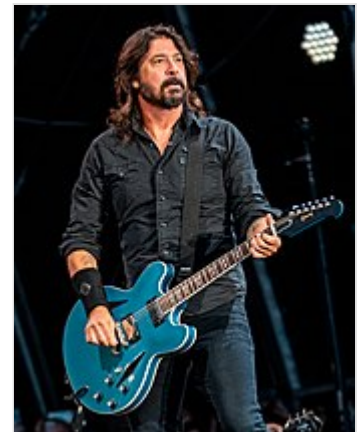
Dave Grohl (pictured in 2019) founded Foo Fighters after his band Nirvana disbanded in 1994.