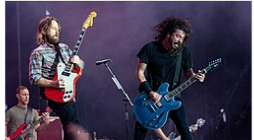
The Foo Fighters performing at Download Festival Paris in June 2018

The Foo Fighters have been described as alternative rock , [8][135][136] post-grunge , [137][138][139] hard rock , [140][141][142] grunge , [143][144] power pop , [145] and pop rock . [146] They were initially compared to Grohl's previous group, Nirvana . Grohl acknowledged that Kurt Cobain was an influence on his songwriting: "Through Kurt, I saw the beauty of minimalism and the importance of music that's stripped down." The Foo Fighters also used the technique of shifting between quiet verses and loud choruses, which Grohl said was influenced by the members of Nirvana "liking The Knack , Bay City Rollers , Beatles , and ABBA as much as we liked Flipper and Black Flag , I suppose." [5] When comparing the legacies of the two bands, Pitchfork said the Foo Fighters' "may not be anywhere near as glamorous or as era-defining as that of [Nirvana], but in a way, it's much more difficult and thankless". The publication would also call Grohl and the band "excellent at being mainstream" and being "his generation's answer to Tom Petty —a consistent hit machine pumping out working-class rock." [147]