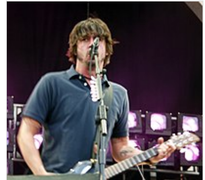
Grohl performing with the Foo Fighters in 2003

Near the end of 2001, the Foo Fighters reconvened to record their fourth album . After spending four months in a Los Angeles studio, the album "just didn't sound right" and the band had no confidence it would sell well. With the album not reaching their expectations amid much infighting, Grohl spent some time helping Queens of the Stone Age complete their 2002 album Songs for the Deaf . Once that album was finished and touring had started for both the Foo Fighters and Queens of the Stone Age, the band was on the verge of breaking up entirely. Grohl reunited with Hawkins, Shiflett, and Mendel to play the Coachella Festival , alternating days with Queens of the Stone Age. Hawkins and Grohl talked about resuming work on One by One and after a very satisfying performance the following day, they agreed to stay together. The group re-recorded nearly all of the album in a ten-day stretch at Grohl's home studio in Alexandria, Virginia , the following month. [19] The original version of One by One , referred to by the band as Million Dollar Demos, has never been released in its entirety although seven tracks were leaked online in 2012 and 2015. [30]