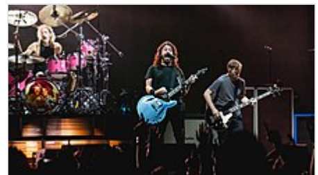
The Foo Fighters performing in 2017