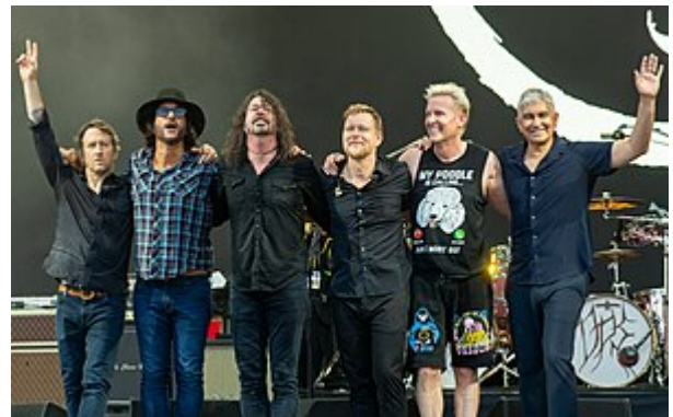
Foo Fighters at Glastonbury Festival 2023 . From left: Chris Shiflett, Rami Jaffee, Dave Grohl, Nate Mendel, Josh Freese and Pat Smear.