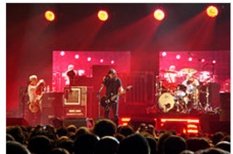
The Foo Fighters performing live in 2007

For the follow-up to In Your Honor , the band recruited The Colour and the Shape producer Gil Norton . Echoes, Silence, Patience & Grace was released on September 25, 2007. The album's first single, " The Pretender ", was issued to radio in early August. In mid-to-late 2007 " The Pretender " topped Billboard's Modern Rock chart for a record 19 weeks. The second single, " Long Road to Ruin ", was released in December 2007, supported by a music video directed by longtime collaborator Jesse Peretz (formerly of the Lemonheads ). [36] Other singles included " Let It Die " and " Cheer Up, Boys (Your Make Up Is Running) ".