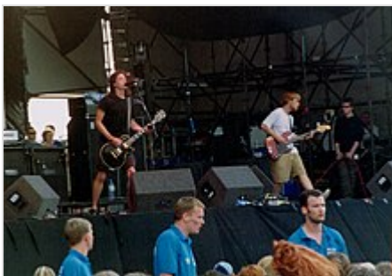
The Foo Fighters performing at Phoenix Festival in 1996