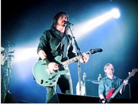
The Foo Fighters performing in December 2011

In September 2011 before a show in Kansas City , the band performed a parody song in front of a protest by the Westboro Baptist Church . It mocked the church's opposition to homosexuality and was performed in the same faux-trucker garb that was seen in the band's Hot Buns promotional video. [49][50]