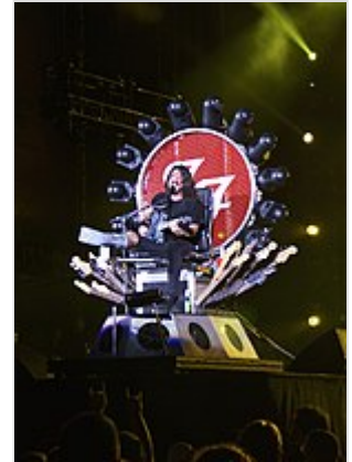
Grohl performing at Fenway Park in 2015 on a custom-built throne while recuperating from a broken leg

Starting in November 2020, promotion for the album ramped up. Its title, Medicine at Midnight , and release date, February 5, 2021, were announced. The band released three singles ahead of the album: "Shame Shame", "No Son of Mine", and "Waiting on a War". [111] In January, the band performed at the US Presidential Inauguration of Joe Biden . [112]