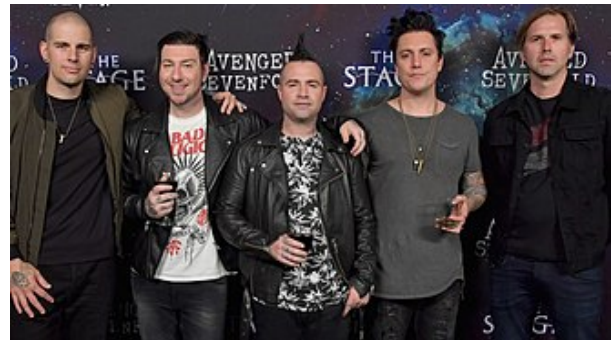
Avenged Sevenfold in 2016. From left to right: M. Shadows , Zacky Vengeance, Johnny Christ, Synyster Gates , and Brooks Wackerman