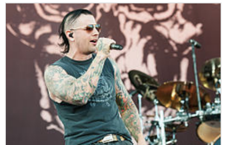
M. Shadows at Rock im Park , Germany, 2014