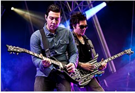
Zacky Vengeance and Synyster Gates live in Norway in 2011