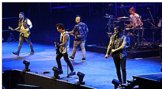
Avenged Sevenfold on stage in Dublin, Ireland, 2017

In a December 2017 interview with Billboard , M. Shadows revealed that the band are planning "a big US summer 2018 tour", and that the band would start working on the follow-up to The Stage in late 2018. [100] End of the World tour with Prophets of Rage was later announced for summer 2018. [101][102] The band was also announced as one of the headliners of 2018's Rock on the Range and Download Festival , in addition to appearing at Hellfest , Graspop Metal Meeting , Rock am Ring and Rock im Park the same year. [103][104] Due to a blood blister forming in M. Shadows' throat, the band cancelled remaining dates from their summer tour with Prophets of Rage . [105]