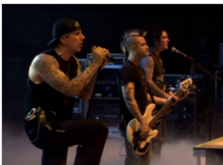
The band performing in 2008

After playing Ozzfest in 2006, Avenged Sevenfold memorably beat out R&B Singers Rihanna and Chris Brown , Panic! at the Disco , Angels & Airwaves and James Blunt for the title of Best New Artist at the MTV Video Music Awards , thanks in part to their Fear and Loathing in Las Vegas -inspired song " Bat Country ". [32] They returned to the Vans Warped Tour, this time headlining and then continued on their own "Cities of Evil Tour". [33] In addition, their lead single " Bat Country " reached No. 2 on the Billboard Mainstream Rock Charts, No.6 on the Billboard Modern Rock Charts and the accompanying video made it to No. 1 on MTV's Total Request Live . [34] Propelled by this success, the album sold well and became Avenged Sevenfold's first Gold record. [35] It was later certified platinum in August 2009. Avenged Sevenfold was invited to join Ozzfest tour on the main stage, alongside other well