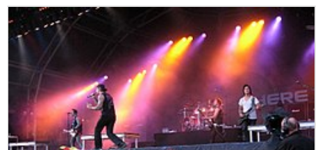
Avenged Sevenfold performing at the Sonisphere Festival on August 2, 2009. This was The Rev's final show with the band before his death.

In January 2009, M. Shadows confirmed that the band was writing the follow-up to their self-titled fourth album within the upcoming months. [44] They also played at Rock on the Range , from May 16–17, 2009. [45] On April 16, they performed a version of Guns N' Roses' "It's So Easy" onstage with Slash , at the Nokia Theater in Los Angeles. [46] On December 28, 2009, the band's drummer James "The Rev" Sullivan was found dead at his home at the age of 28. [47] Autopsy results were inconclusive, [48] but on June 9, 2010, the cause of death was revealed to have been an "acute polydrug intoxication due to combined effects of Oxycodone, Oxymorphone, Diazepam/Nordiazepam and ethanol". [49] In a statement by the band, they expressed their grief over the death of The Rev and later posted a message from Sullivan's family which expressed their gratitude to his fans for their support. [50][51] The band members admitted in a number of interviews that they considered disbanding at this point in time. [52][53] On February 17, 2010, Avenged Sevenfold stated that they had entered the studio, along with Dream Theater drummer Mike Portnoy , to drum for the album, in place of The Rev. [54]