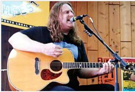
Guitarist Warren Haynes , seen here in the late 1990s, joined the band for their second reunion.