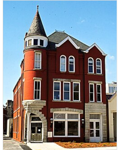
Location of the band's first paid performance