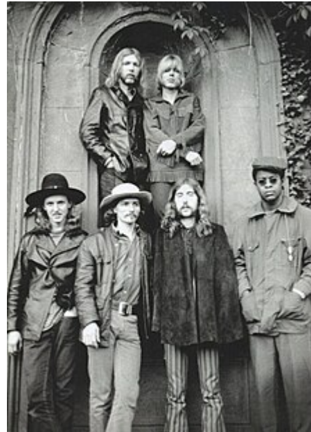
The Allman Brothers Band in May 1969. From left to right, (back) Duane Allman , Gregg Allman ; (front) Butch Trucks , Dickey Betts , Berry Oakley , and Jaimoe .