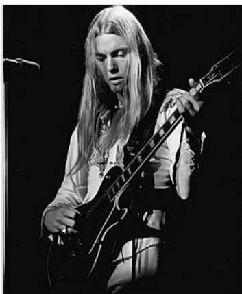
Gregg Allman on the band's 1975 tour