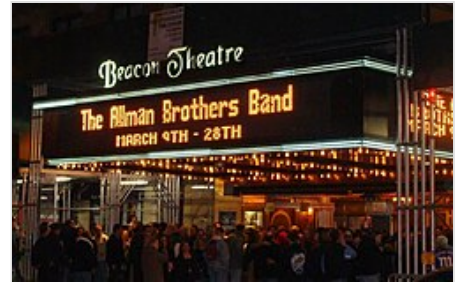
The band's 2009 residency at New York's Beacon Theatre was considered a career highlight. [84]

The group recruited Oteil Burbridge of the Aquarium Rescue Unit to replace Woody on bass, and Jack Pearson on guitar. [131] Concerns arose over the increasing loudness of Allman Brothers shows, which were largely centered on Betts. [130] Pearson, struggling with tinnitus, left as a result following the 1999 Beacon run. [132] Trucks phoned his nephew, Derek Trucks , to join the band for their thirtieth anniversary tour. [133] Trucks was very young, at age 20, and younger than any of the original members when the band formed. "It was an honor to be part of such a great institution from the start," said Derek Trucks. [133] "When I first got the gig, I was just trying to maintain the spirit of the whole thing while hopefully bringing some fire to it, hoping to hold up my end while also expressing my own voice." [133] The Beacon run in 2000, captured on Peakin' at the Beacon , was ironically considered among the band's worst performances; an eight-show spring tour led to even more strained relations in the group. [134] "It had ceased to be a band—everything had to be based around what Dickey was playing," said Allman. [135] Anger boiled over within the group towards Betts, which led to all original members sending him a letter, informing him of their intentions to tour without him for the summer. [136]