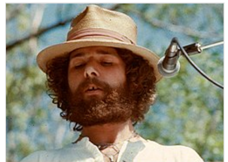
Keyboardist Chuck Leavell began contributing to the band in 1973.